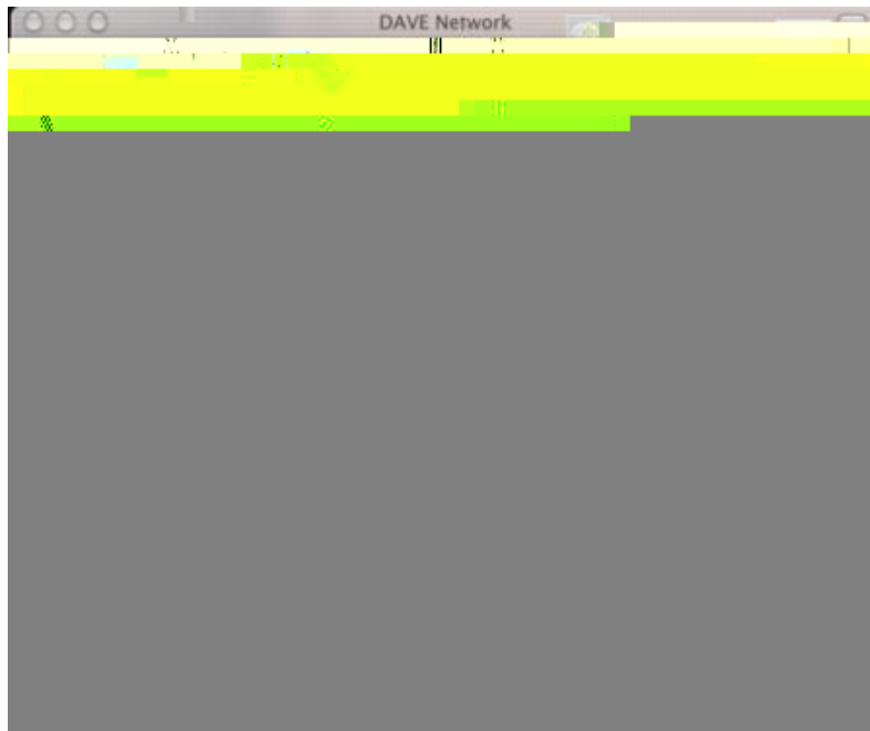
fig5 : notice the cool feature which allows you to chose your connection ports